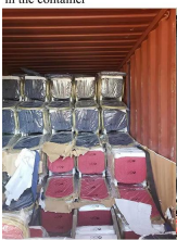
40HQ loading quantity: 2000pcs Hard cardboards were spreaded in the container