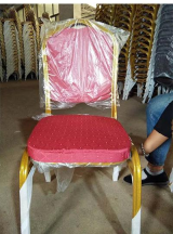
Iron frame size: 25*25*0.6mm