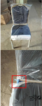
Package: Plastic bag Non woven fabric Hard cardboard More harder and stronger