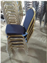
Iron frame size 25*25*1.1mm(after painting)