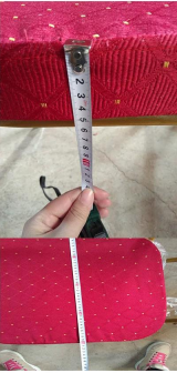
Seat thickness around 5cm